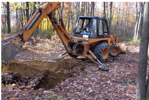
Test pits being dug for soil evaluation.

Sanitarians provide an important service by ensuring a healthy environment for the citizens of Connecticut. In larger departments, you might specialize in one or more specific areas. In the smaller or more rural departments, your job would more likely to include all of the above tasks.